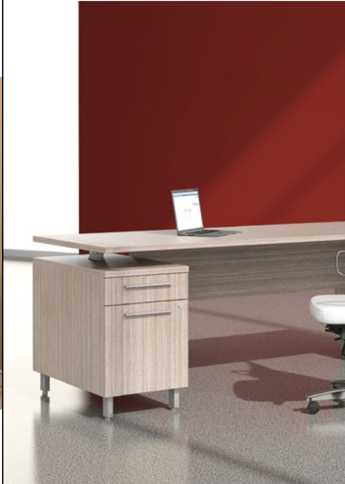
height adjustable tables