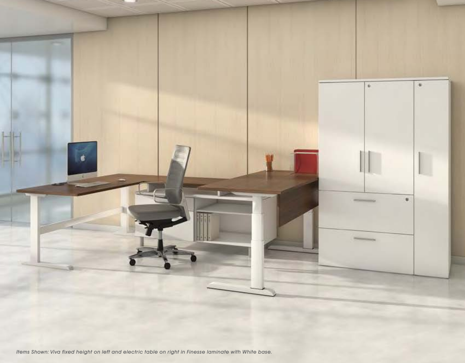
Items Shown: Viva fixed height on left and electric table on right in Finesse laminate with White base.