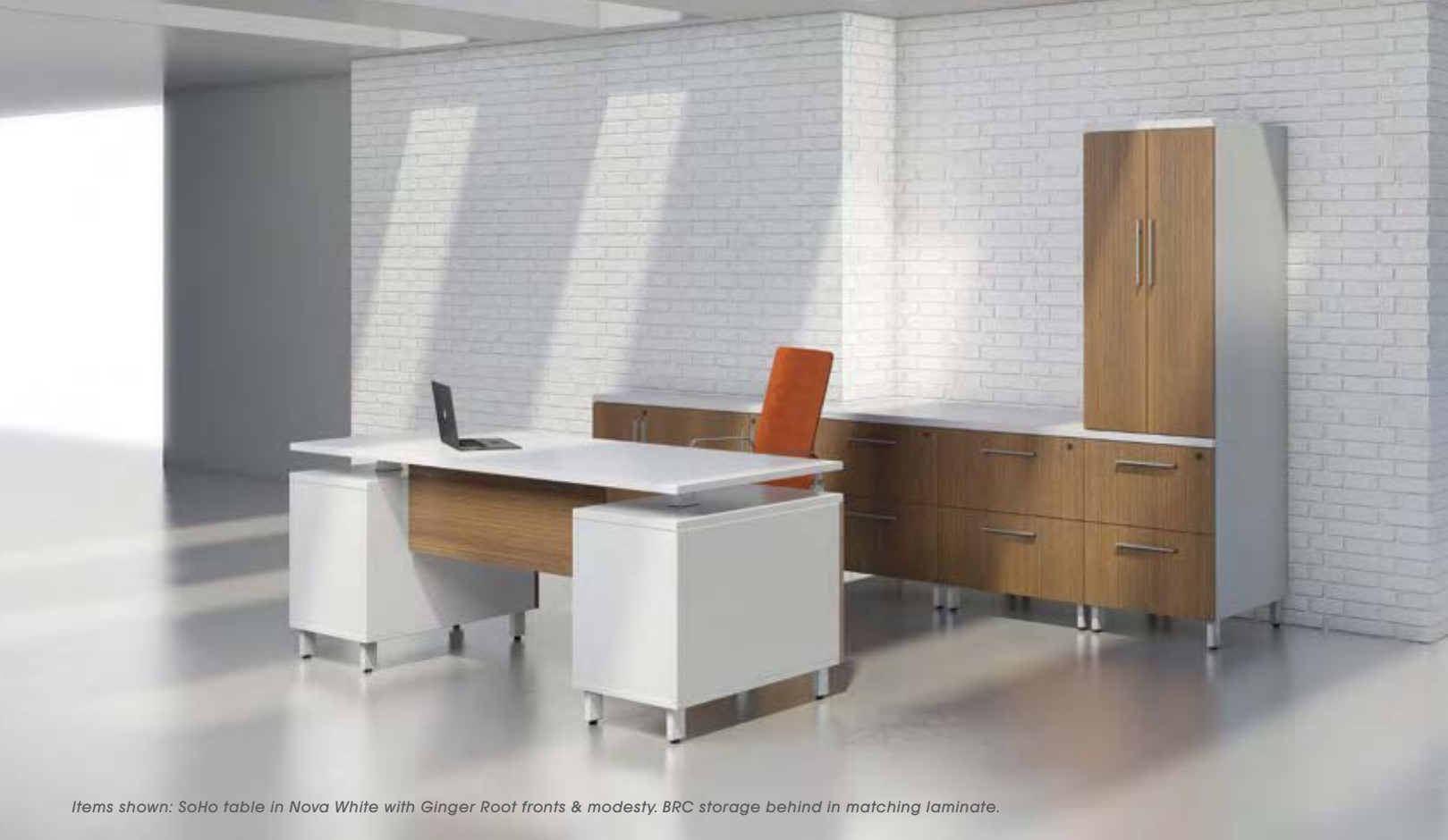
Items shown: SoHo table in Nova White with Ginger Root fronts & modesty. BRC storage behind in matching laminate.