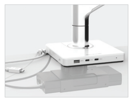
M/Connect 3 Docking Station