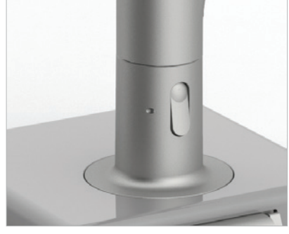
Quick Release Joints