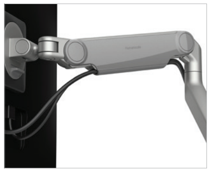
Rubberized Cable Management