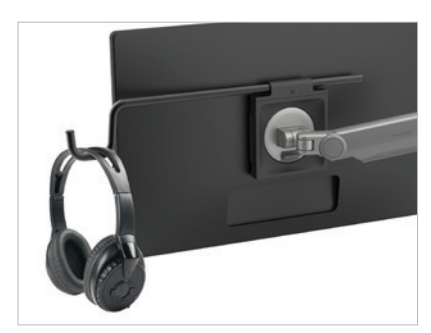
Accessory Holder (optional)